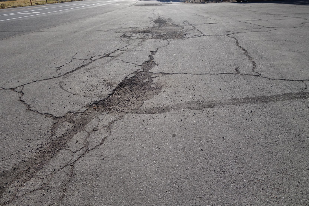
Bowers NDF Fire Station Site (Vacant) - FCA Site #9903 Description: Failing Pavement – Crack, Patch and Slurry Seal Needed.