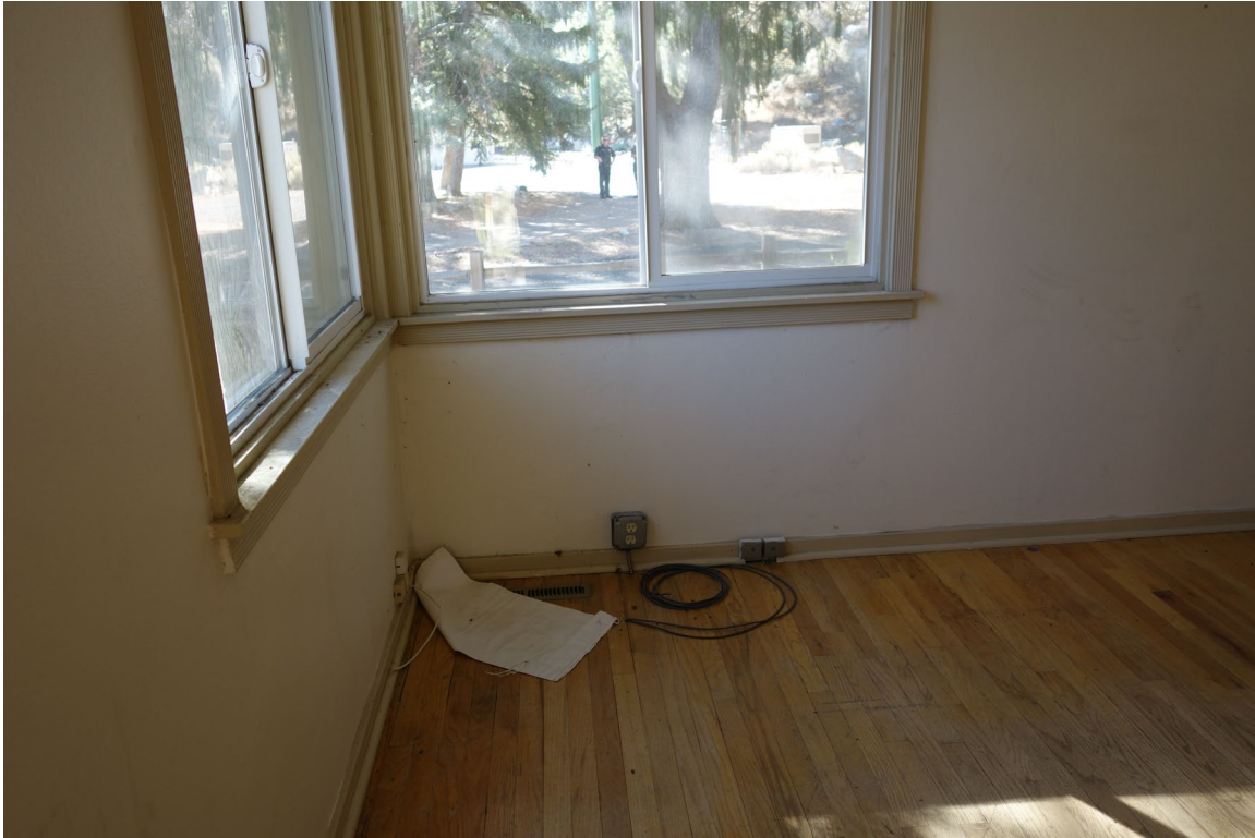
Bowers Fire Station Residence (Vacant) - FCA Building #2480 Description: Flooring Refinish Needed.