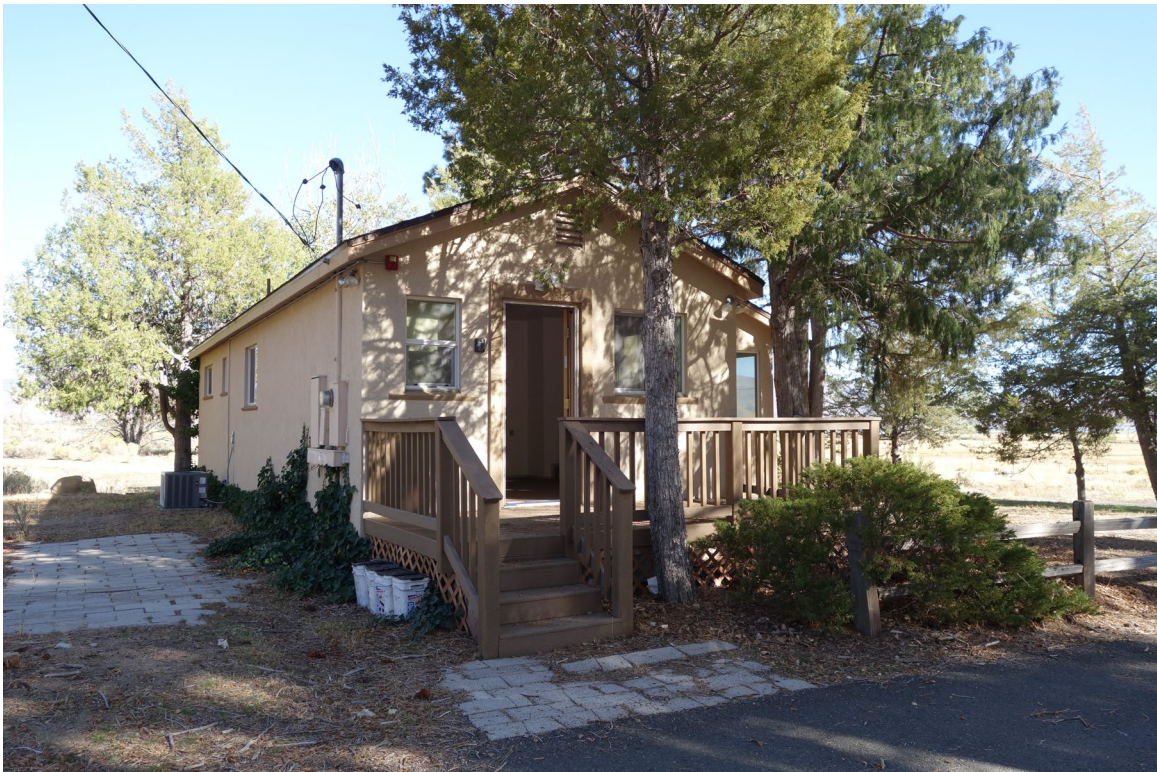
Bowers Fire Station Residence (Vacant) - FCA Building #2480 Description: Building Exterior and ADA Ramp Needed.