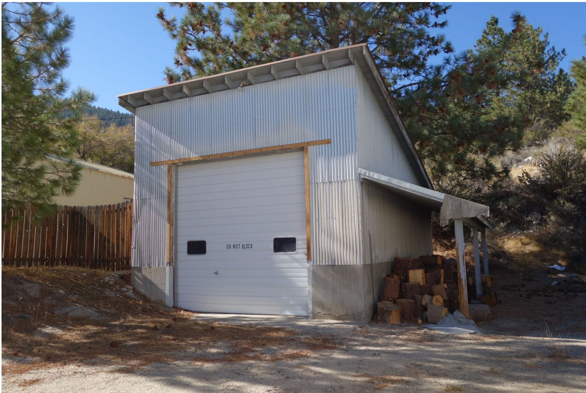
Storage Shed (Vacant) - FCA Building #2481 Description: Exterior of the Building.