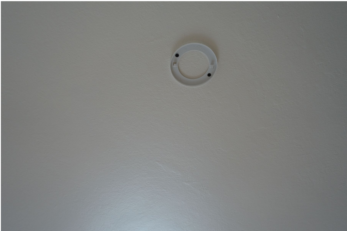
Bowers Fire Station Residence (Vacant) - FCA Building #2480 Description: Wired Smoke and Carbon Monoxide Detectors Needed.