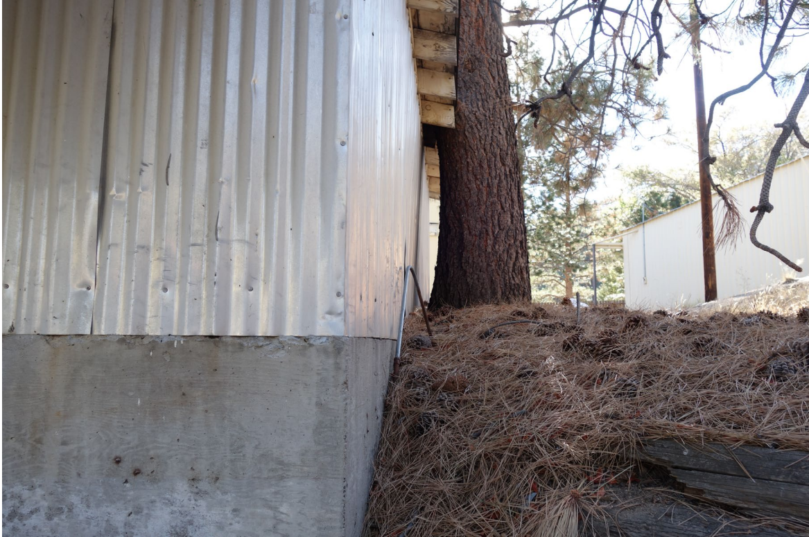
Storage Shed (Vacant) - FCA Building #2481 Description: Tree Removal and Structural Assessment of Stem Wall Needed.