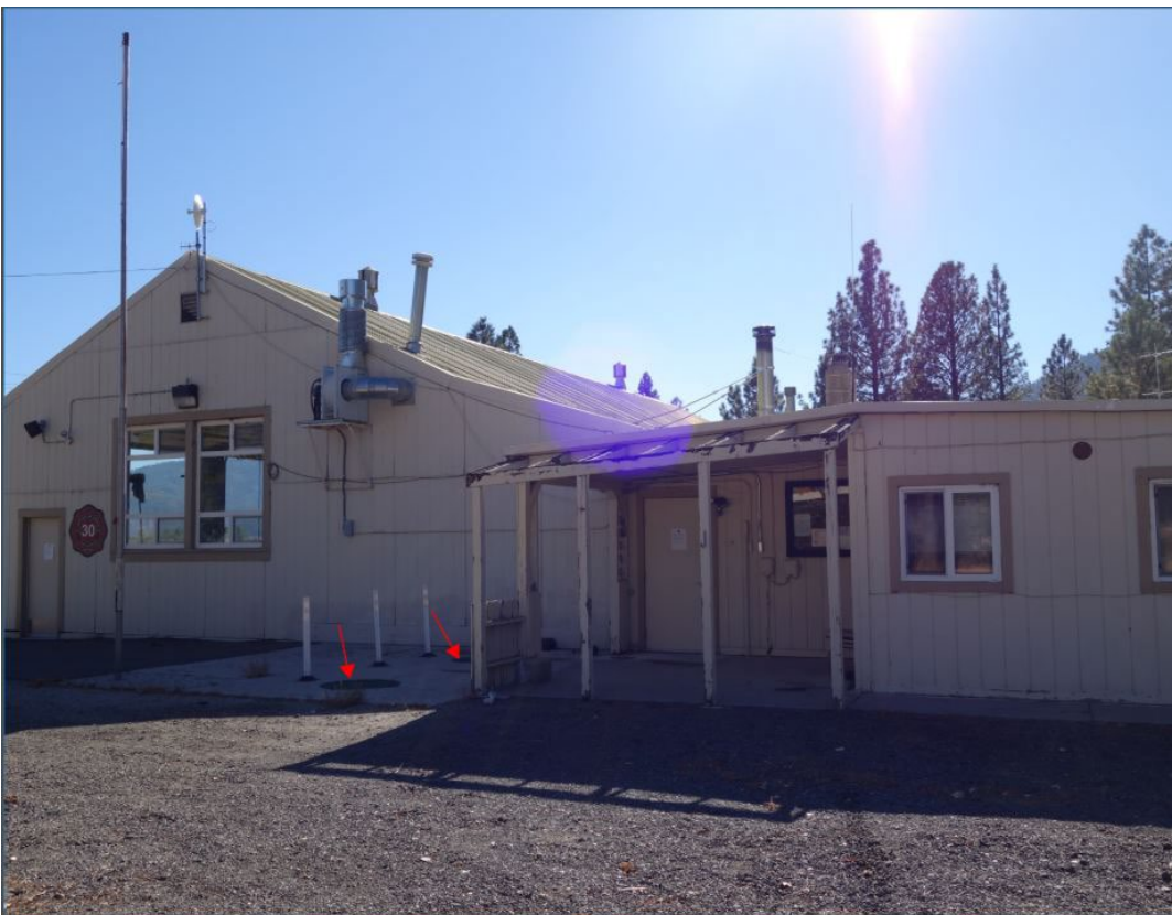
Bowers NDF Fire Station Site (Vacant) - FCA Site #9903 Description: 1 st Septic Tank Maintenance Located NE of Apparatus Bay/Annex (#2479).