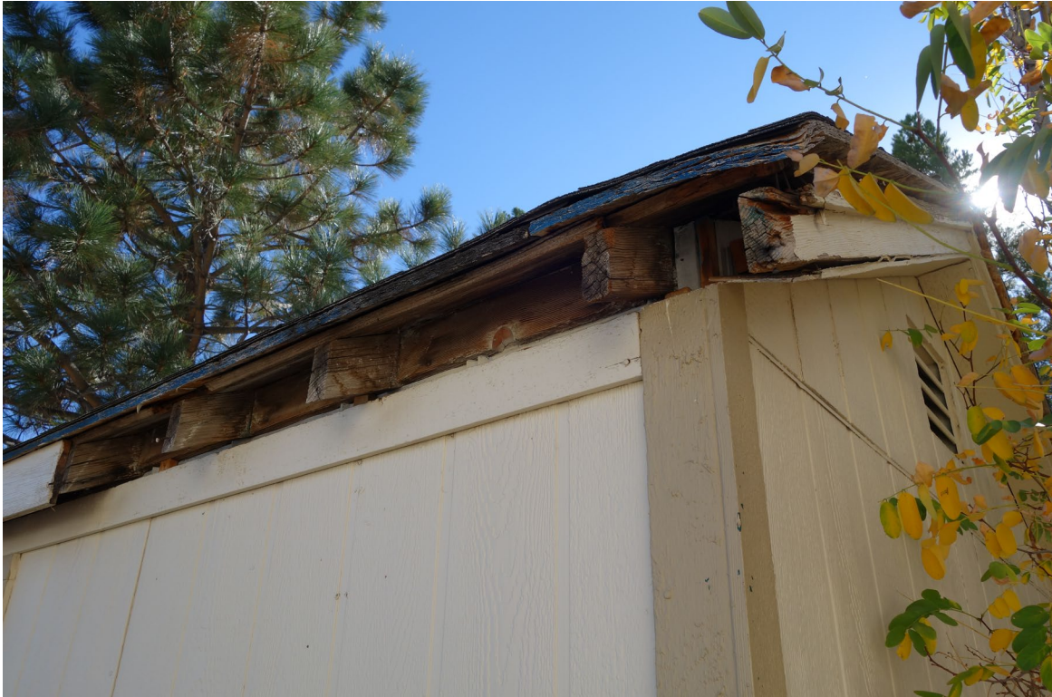
Domestic Well Pump House (Vacant) - FCA Building #2482 Description: Structural Repairs Needed.