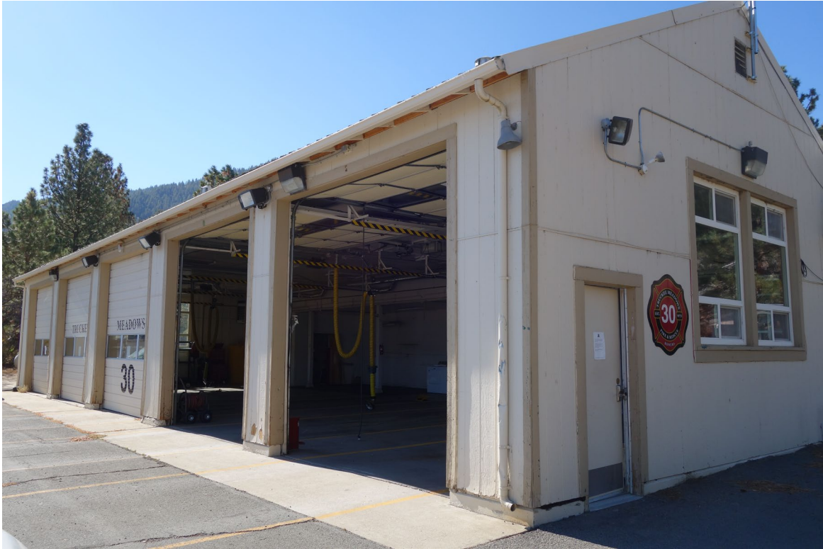
Bowers Fire Station Apparatus Bay/Annex (Vacant) - FCA Building #2479 Description: View of the Building.