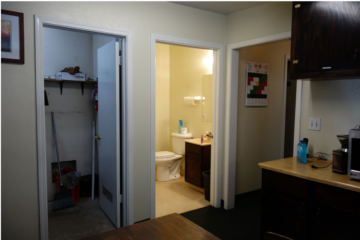
Bowers Fire Station Apparatus Bay/Annex (Vacant) - FCA Building #2479 Description: Accessible Unisex Restroom Needed.