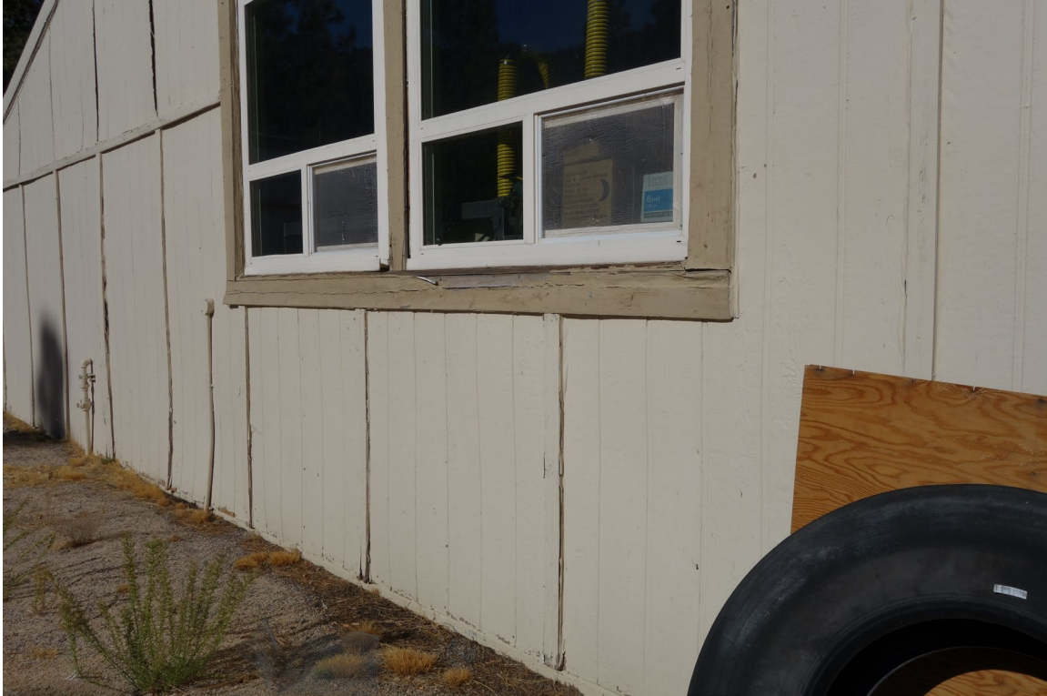
Bowers Fire Station Apparatus Bay/Annex (Vacant) - FCA Building #2479 Description: Siding Replacement and Clearance to Grade Needed.