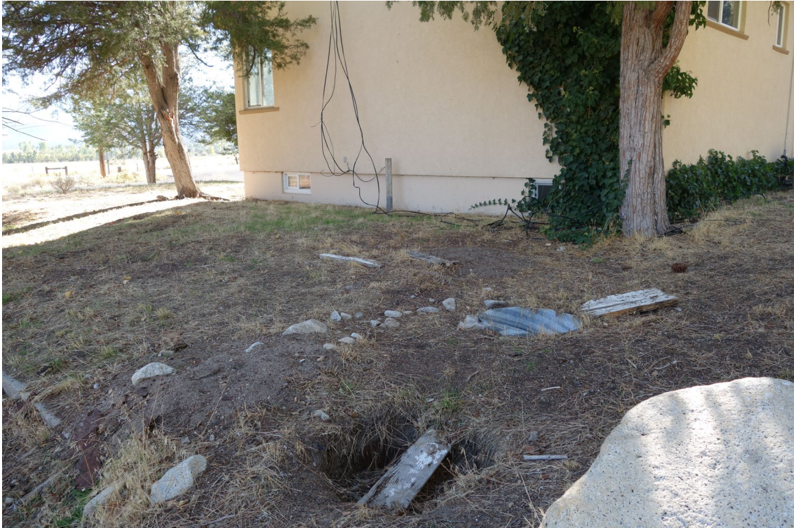
Bowers NDF Fire Station Site (Vacant) - FCA Site #9903 Description: 2 nd Septic Tank Maintenance Located NE of Residence (#2480).