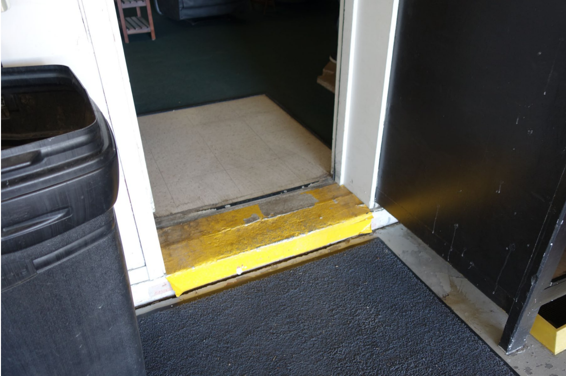
Bowers Fire Station Apparatus Bay/Annex (Vacant) - FCA Building #2479 Description: Interior Ramps/Accessibility Needed.