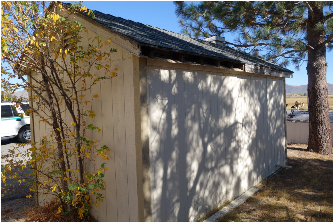
Domestic Well Pump House (Vacant) - FCA Building #2482 Description: Shrub Removal Needed.