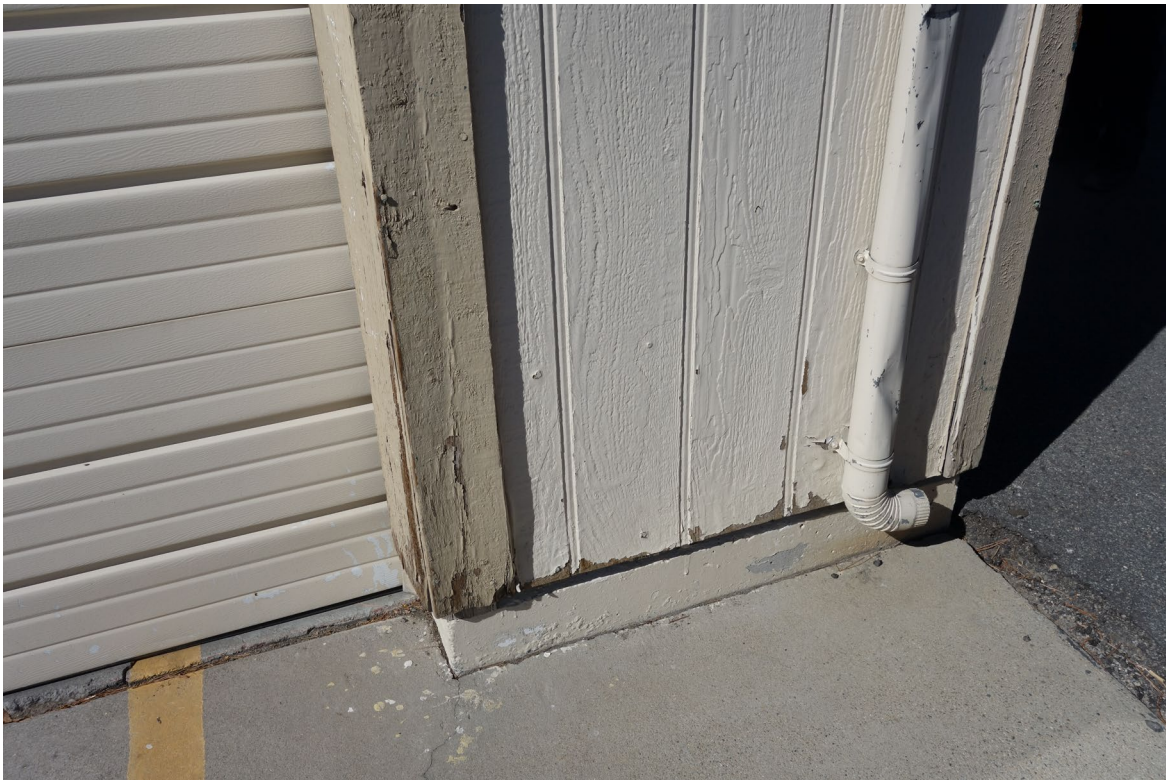
Bowers Fire Station Apparatus Bay/Annex (Vacant) - FCA Building #2479 Description: Roof Drain Downspout Replacement Needed.